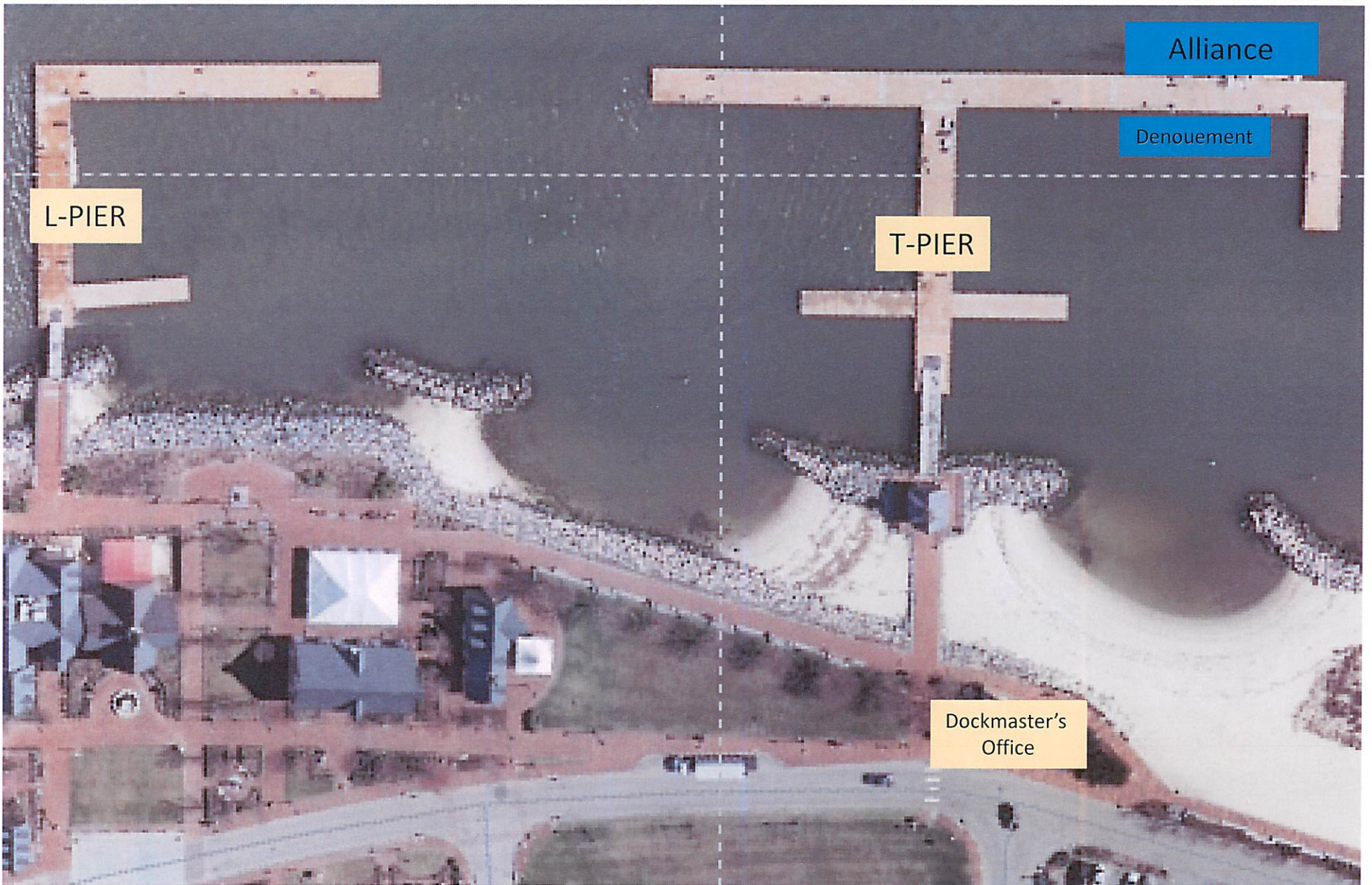
YSC – Primary Docking Locations