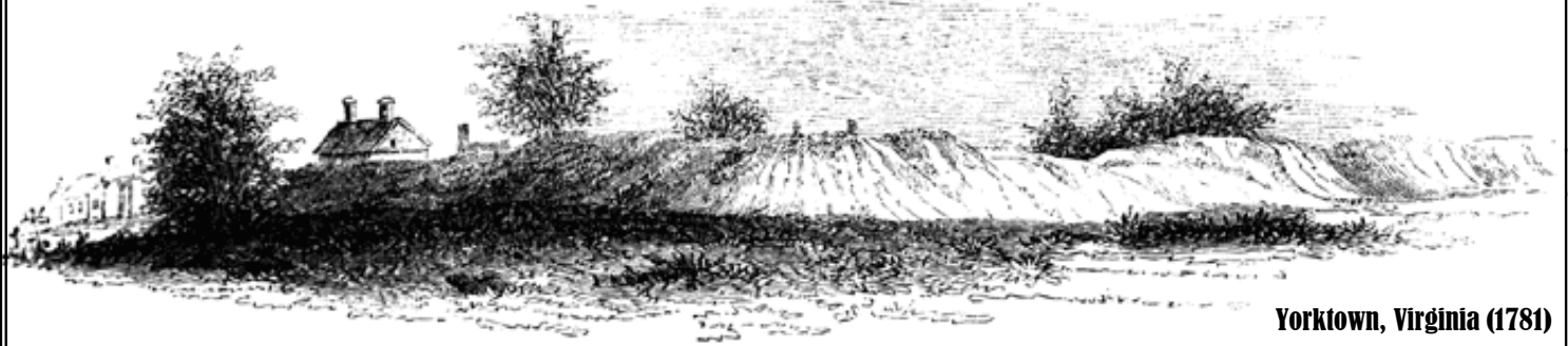
Yorktown, Virginia (1781)